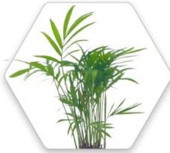
Bamboo cane Palm