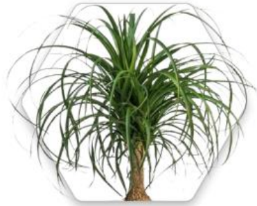
Pony Tail Palm